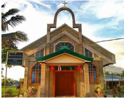
Image: Resurrection Episcopal Church, Ormoc City, Philippines.