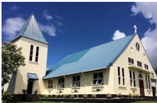
Image: All Saints' Church, Apia, Samoa

All prayers are treated as confidential.