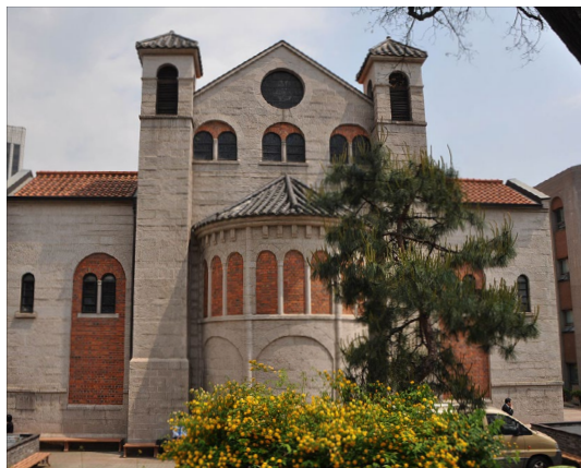
Image: The Cathedral Church of St Mary the Virgin and St Nicholas, Seoul, Korea.