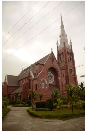
Image: Holy Trinity Cathedral, Yangon, Myanmar