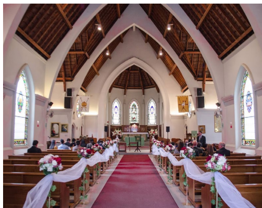
Image: The Anglican Cathedral of the Good Shepherd, Milaflores, Peru.